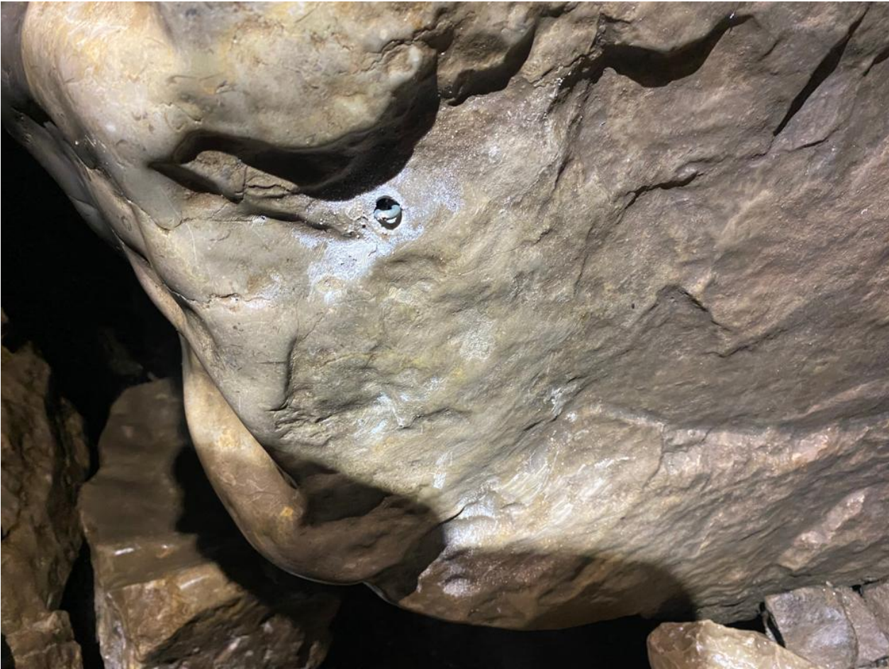
After the repair